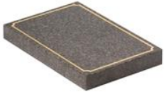
Typical plaque for used in cremated remains area.