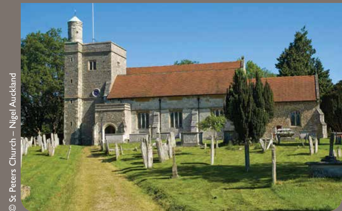
© St. Peter's Church – Nigel Auckland