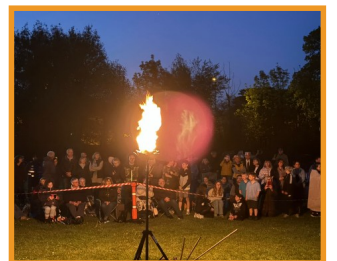
Lighting of the Beacon

This event on the 8th May was a National Celebration of the 80th Anniversary of VE Day which marked the end of the war in Europe and WWII as a whole on 8th May 1945. Many members of our community attended and it was lovely to see so many enjoying themselves and singing along to their wartime favourites. Our thanks go to English Heritage, The Museum Trust, Guides, Scouts and the military band as well as all those who volunteered and gave up their time to help at this event.