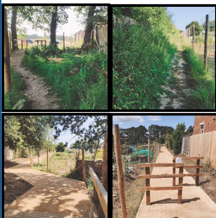
Before and after photographs of the path connecting Bishop's Meadow to Albany Road

We would like to share our thanks to BQS Management Services Ltd for their professionalism and high standard of work on these two sections of pathway. These photographs showcase the transformation. We hope residents enjoy the benefits of this new pathway and the positive impact it has for our community.