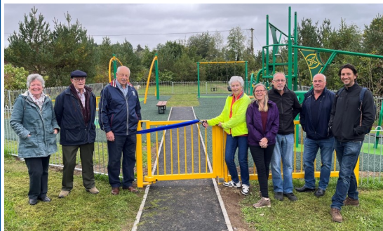
Officially opening the new play areas at the Montague Road estate

Get ready for the next "Forward Plan" in 2024, spanning the next four years. We are eager to gather input from our residents through a forthcoming questionnaire. If you would like to contribute to shaping the future of Bishop's Waltham, please take a few moments to complete the questionnaire when it becomes available. Together, let's work towards fulfilling the aspirations of our parishioners!