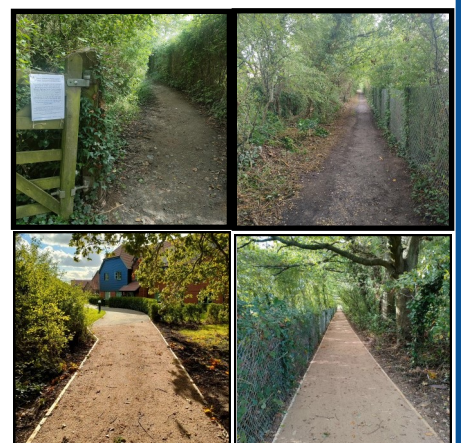
Before and after photographs of the path connecting Tangier Gardens to Priory Park

This newsletter is brought to you by Bishop's Waltham Parish Council. Get updates as they happen.